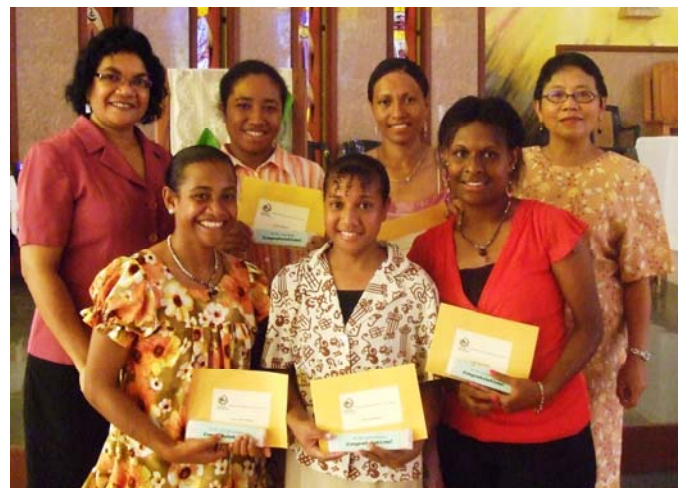
Graduating scholarship recipients from Don Bosco Technological Institute at Graduation Mass on 22 November.